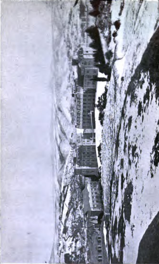
THE ROBERT COLLEGE, BEBEK